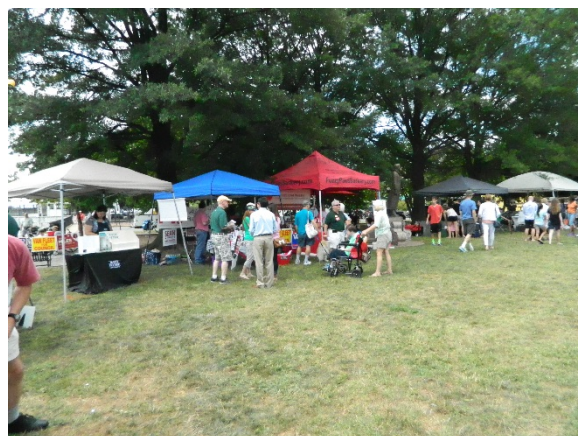
Part of the many tents at the Alexandria Irish Festival.