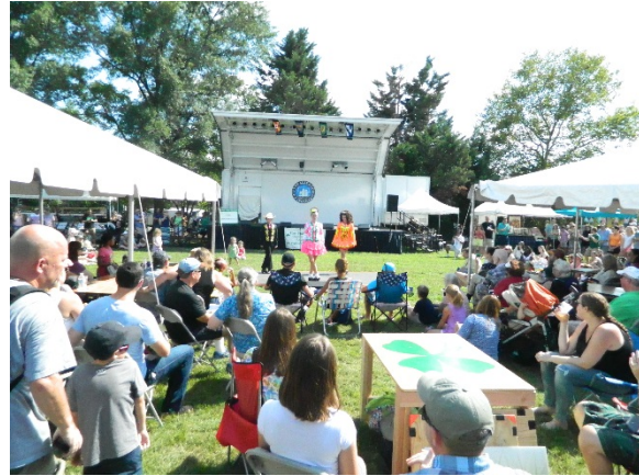
"Shamrocks R Us" dancing for the festival attendees.