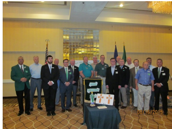
All of the Major Degree recipients from across Virginia