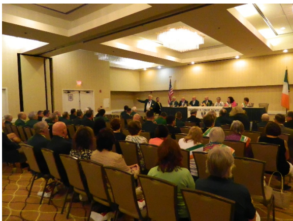
Delegates of the Virginia AOH and LAOH

On Sunday morning the Brian Boru Degree Team exemplified the Order's Major Degrees on 17 Virginia Hibernians, including five Cunningham Division brothers.