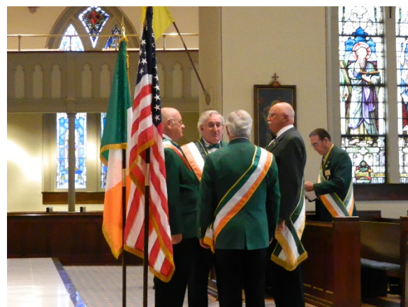
New officers form the cross to take their oaths