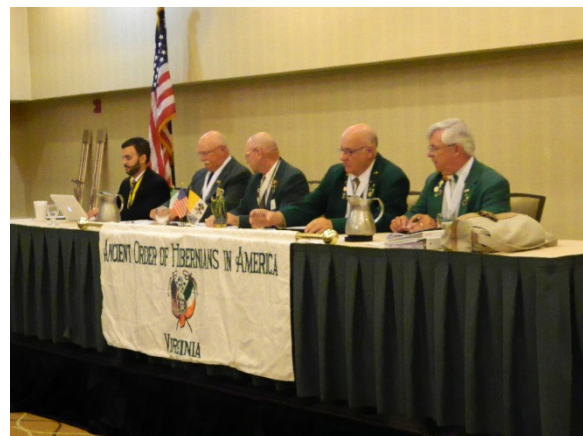
Virginia State Board conducting the business meeting