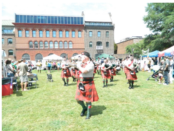
The Alexandria Pipe and Drums Corp leads the Parade to open the festival.