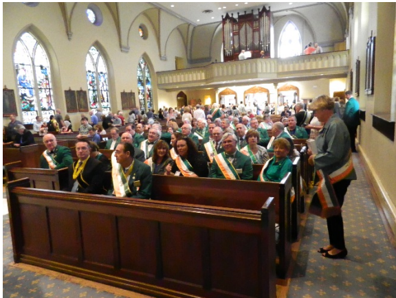
AOH delegates and wives gather at Old St Mary's for Mass and the Initiation of Officers