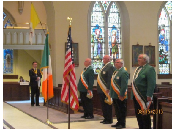
Newly elected officers present themselves for Initiation