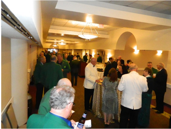
Delegates, wives and friends enjoy a reception before the celebration banquet.