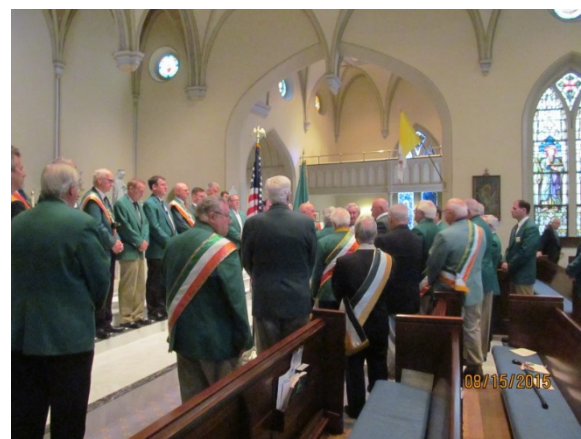
Brother Hibernians form a circle around their officers