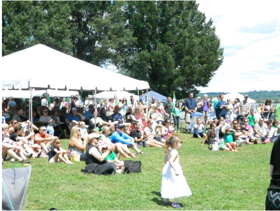
Part of the large crowd enjoying the entertainment.